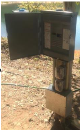
B Dock Panel