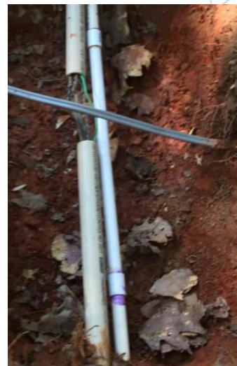
Repaired Boneyard Waterline

This brings me to lake levels, no I cannot fix them, but I wish I could. As you should remember at the beginning of 2016 we were 4.5' over full pond and as of the writing of this article we are right at 10' below full pond (see pictures below). This 14.5' variance causes all of us to keep adjusting dock cables, launch ramps, and mooring scopes. We already have had to move some of the deeper draft boats from the back side of B-dock, some of the boats in the first slips on E-dock, and boats on the shallower moorings. What this means for each member with a boat in the water is that "out of sight out of mind" is not a good position to take. In addition to the low lake levels, winter is upon us and the winds and storms this time of year are rough on all of your hardware and tackle. Please check on your boat, your mooring scope, your dock lines, your mooring pendants, your chafe protection, etc. often and offer to help your dock captain if he needs assistance adjusting your dock. If we do not get some substantial and sustained rainfall, the lake levels will continue to fall and further action will be required of all of us. The north launch ramp dock continues to present us with maintenance challenges in both high and low water conditions. We will review this situation early in the year to decide if it is worth trying to keep the dock in operation.