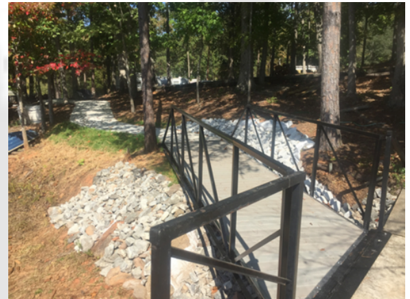
B-Dock Pathway After