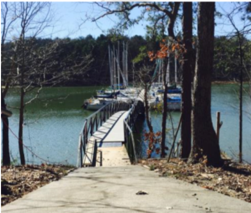
B-Dock Pathway Before