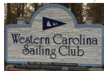
January 3, 2016 Elevation 664.49