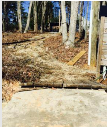
D-Dock Pathway Before