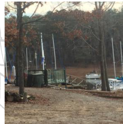
December 14, 2016 Elevation 650.04