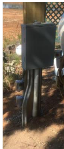
A Dock Panel