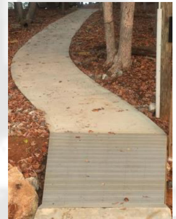
D-Dock Pathway After

Club House - The sewer drain field was repaired on October 3rd and it got its first test during the Hospice Regatta ten days later with over 350 people using the facilities over the weekend. There were no issues with any surface water during the regatta ceremonies on Sunday as the old drain field was abandoned. The grass is now greening up over the first row of the new system, so it is currently working as it should and we have a good stand of new grass over the repair area.