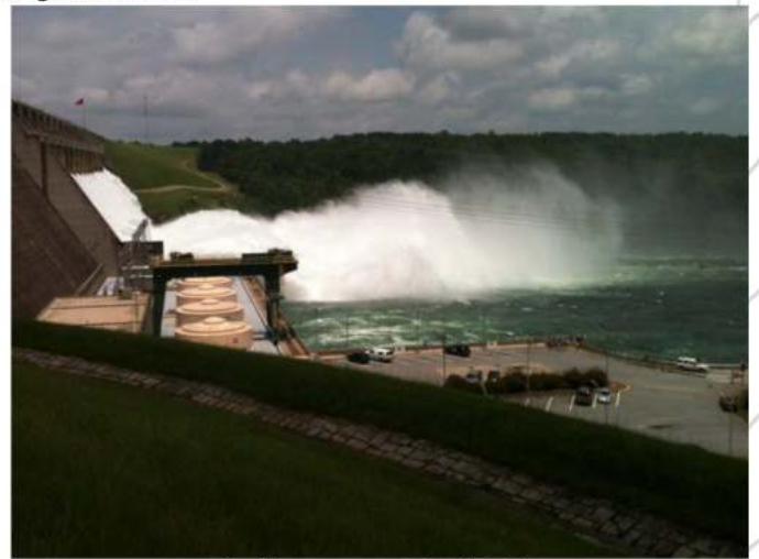
Spillway on July 10th

The lake is still about two feet above full pond – remember this to tell your grandchildren.